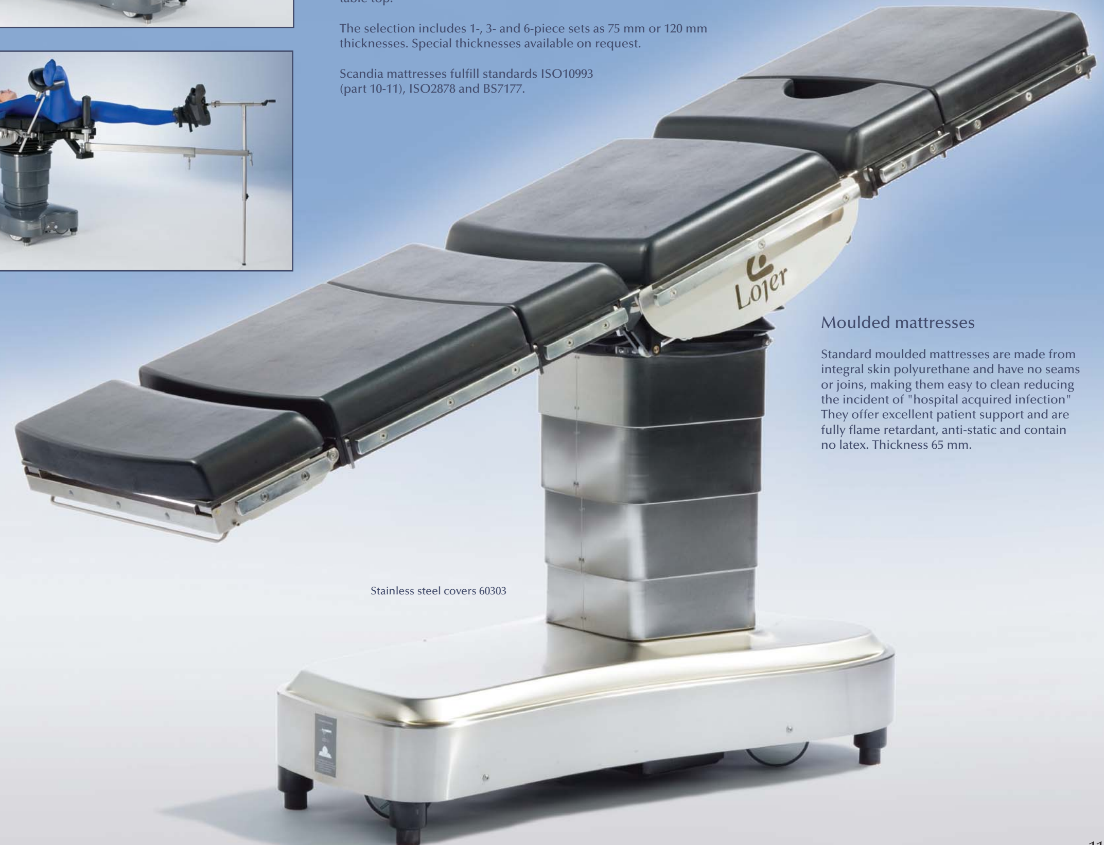
Stainless steel covers 60303

Scandia mattresses fulfill standards ISO10993 (part 10-11), ISO2878 and BS7177.