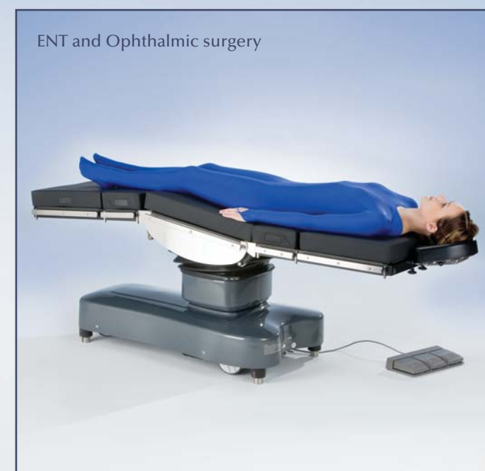
ENT and Ophthalmic surgery