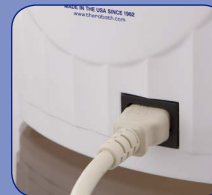
Removable IEC Power Cord