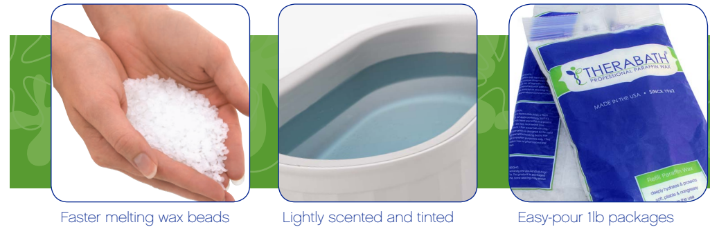
Faster melting wax beads

Therabath Professional Paraffin Wax remains residue-free, while building thick, pliable layers in an easy-to-remove glove. Our paraffin is soft and pliable eliminating the mess found with dry, brittle paraffin waxes. Use the cooled, pliable ball of wax to effectively exercise the hand during rehabilitation, or enjoy soft, youthful, deeply moisturized, and healthy looking skin!