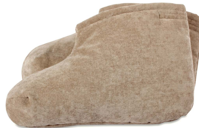
Item - # 2411

Plush Insulated Boots Feature a contoured toe for the best fit, and hook/loop closure. 8 oz. fiber-fill insulated. One size fits most. Made in the U.S.A.