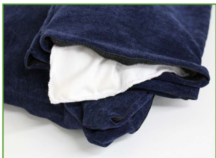
item # 2718

Comfort Heated Mitts When you are away from your Therabath Paraffin Bath, these heated mitts provide the ultimate in comfort and warmth! Simply microwave to warm, or place in the freezer to chill. The ultimate gift of relaxation at an affordable price! Sold as a single mitt, or as a pair of 2 mitts.