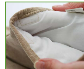
Item - # 2410

Plush Insulated Mitts Hook/loop closure. 8 oz. fiber-fill insulated. One size fits most. Made in the U.S.A.