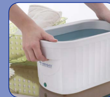
Integrated Handles Safely Increase Mobility