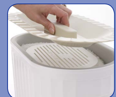
Lid with Integrated Handle