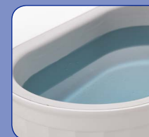
Fully Insulated, Oversized Anodized-Aluminum Tank