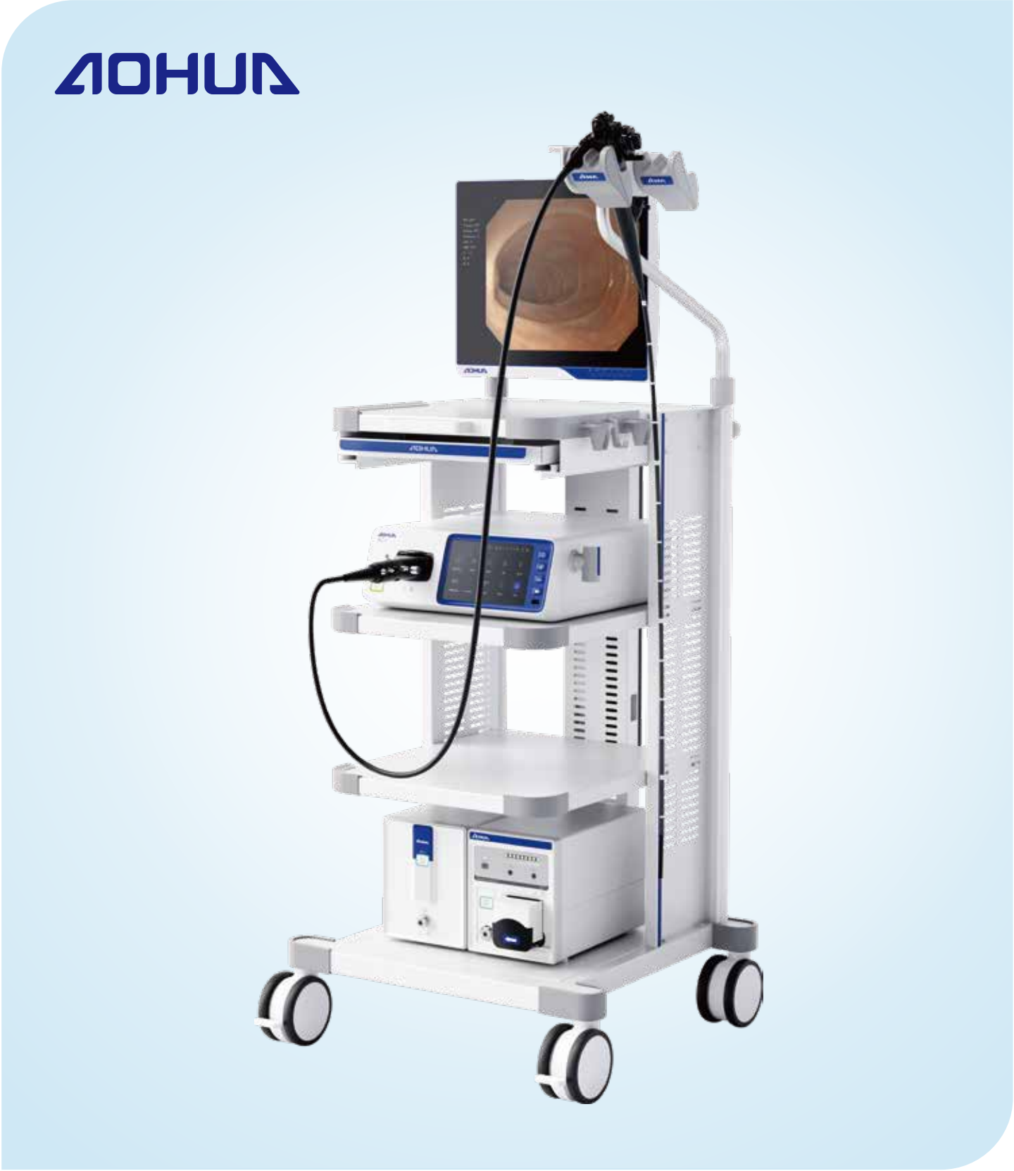
AC-1 Video Endoscopy System